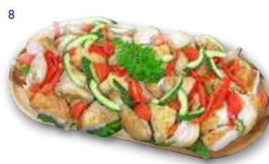
8 ROAST CHICKEN GF H