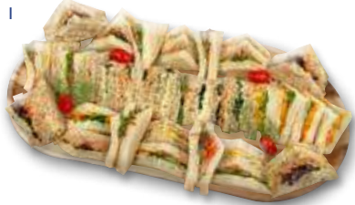
1 SANDWICH Inc.V