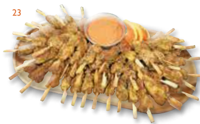
CHICKEN SATAY GF H