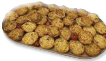
SPINACH QUICHE V