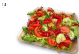
13 GARDEN SALAD V GF