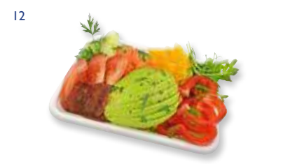
12 DIETARY SALAD BOWL V GF VN H