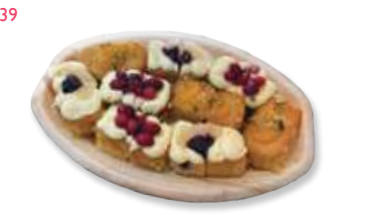
MINI CAKES GF