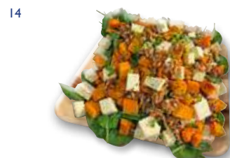
14 PUMPKIN, WALNUT, FETA SALAD V GF