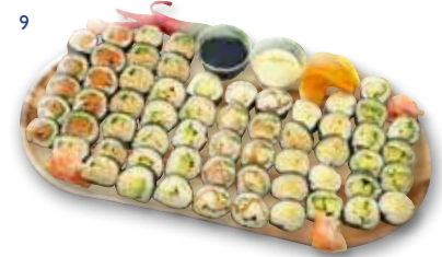
9 SUSHI Inc.V Inc.GF H