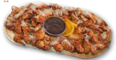
BUFFALO WINGS H