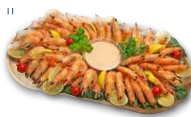
11 COLD PRAWNS GF