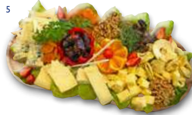
5 GOURMET CHEESE & DRIED FRUIT V GF