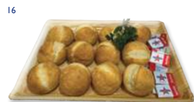
16 RUSTIC DINNER ROLLS & BUTTER