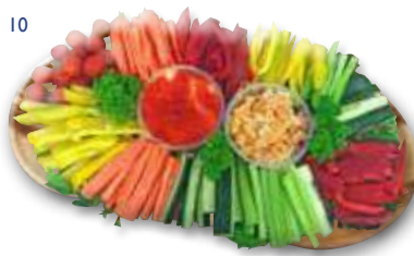
10 VEGETABLE CRUDITÉS & DIPS V GF