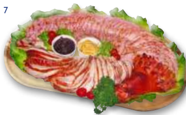
7 TURKEY & HONEY GLAZED HAM