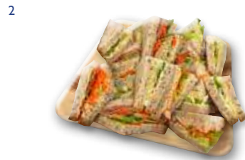
2 GLUTEN FREE SANDWICH Inc.V GF (VN Option)