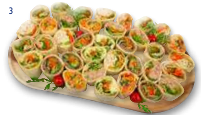
3 MINI WRAPS Inc.V