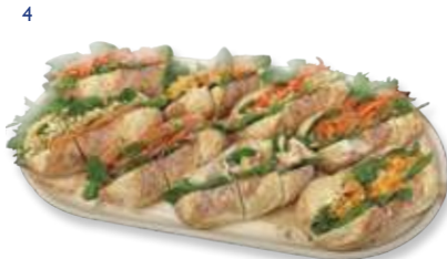
4 MINI STONE BAKED BREADS Inc.V