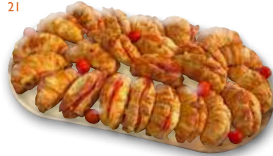
MINI CROISSANTS (V Option)