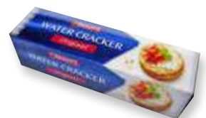
15 WATER CRACKERS